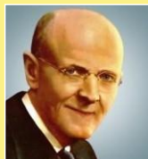
Rtn. Paul Haris Founder of Rotary